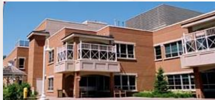
Markhaven Home for Seniors